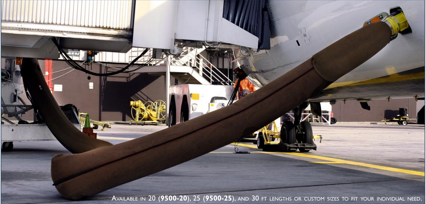
AVAILABLE IN 20 (9500-20), 25 (9500-25), AND 30 FT LENGTHS OR CUSTOM SIZES TO FIT YOUR INDIVIDUAL NEED.

Features standard on products 9500-20, 9500-25, 9500-30