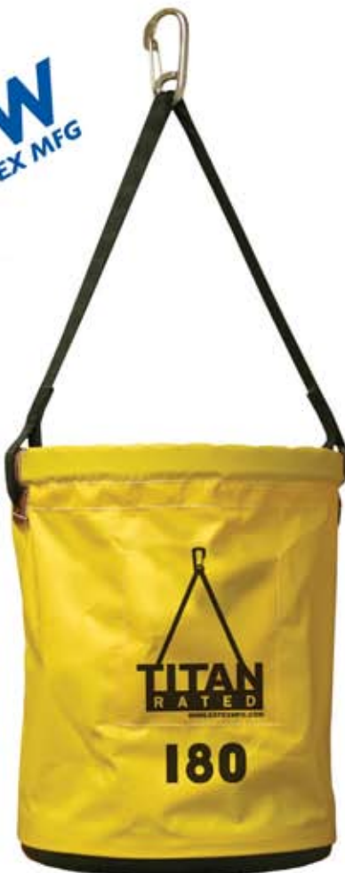
2075-1215V yellow vinyl Load Rated at 180lbs

Certified maximum Safe Working Load Limit. Each bucket has a unique serial number provided to facilitate tracking and inspection protocols.