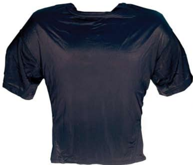
1618-N-(S-2X) Short sleeved shirt (NAVY)* 1619-N-(S-2X) Long sleeved shirt (NAVY)*