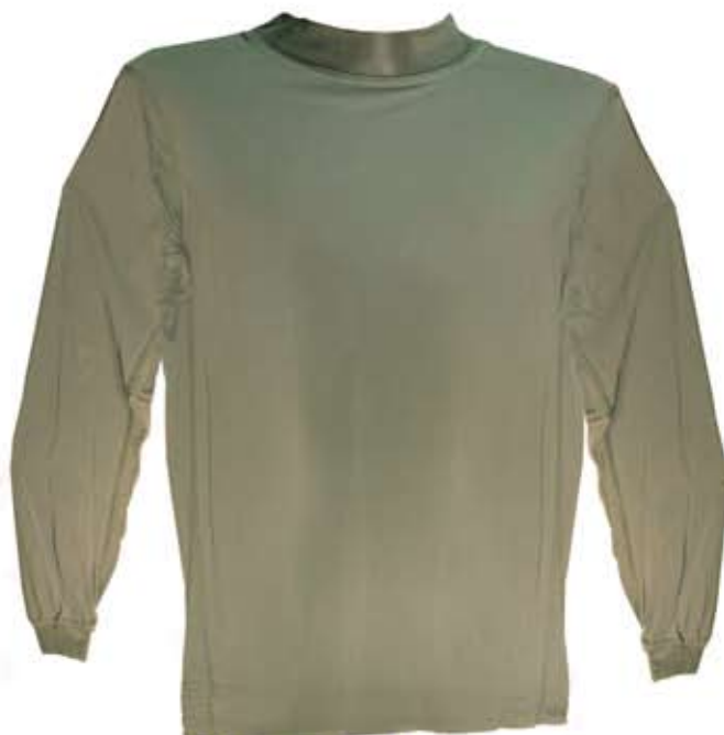
1618-OD-(S-2X) Short sleeved shirt (OLIVE DRAB)* 1619-OD-(S-2X) Long sleeved shirt (OLIVE DRAB)*