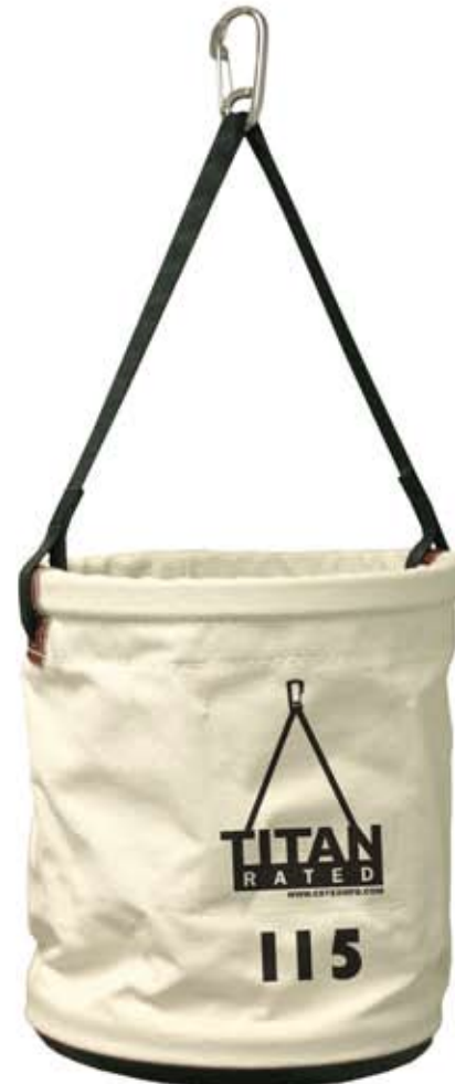
2075-1215 canvas duck Load Rated at 115lbs